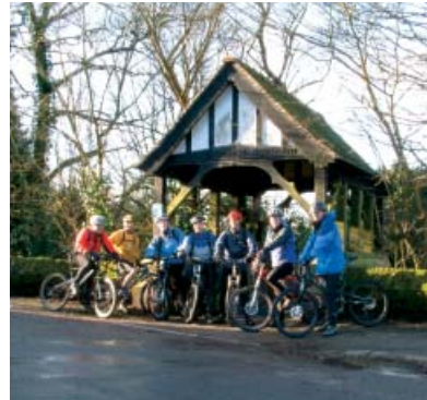
9. Sunnhurst Lychgate and Cyclists

Take the first right through the Lychgate 9 into the wood and then the right-hand fork. Continue down the hill turning right at the bandstand. Keep to the path on the right bank of the stream to return to the Visitor Centre.