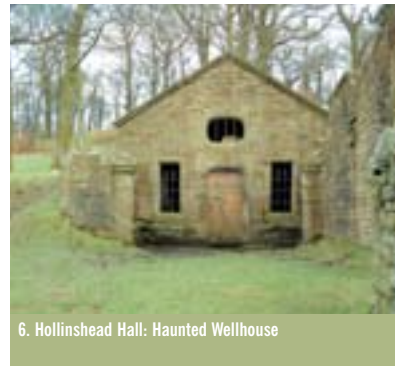
6. Hollinshead Hall: Haunted Wellhouse

Miners built most of the tracks over Darwen Moor and the plateau has the remains of many filled-in mine shafts, spoil heaps and even the bed of an old steam engine. There were no less than 21 pits with a further dozen or so scattered around the moor where poor grade coal was mined for over 300 years. In the 19th century the coal was used to