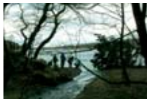
2. Roddlesworth Upper Reservoir

Turn right up the track eventually emerging onto Tockholes Road, built by Eccles Shorrock in the 1840s to link the village with Darwen. Eccles Shorrock is best known today for the 300 foot Venetian campanile chimney of India Mill, Darwen. Turn left and after 100 yards take the footpath on the right down into the wood. As the Roddlesworth Upper Reservoir 2 comes into view, follow the path round to the left.