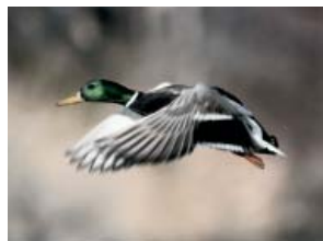
3. Spot the birdlife amidst Reservoir country

In about 100 yards a footpath crosses the track, turn right here and left at the reservoir. Follow the path round by a fence then a wall to cross the bridge over Rocky Brook, the local name of the River Roddlesworth.