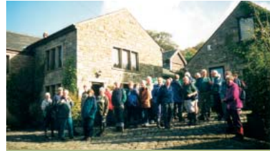
8. Rambling over the Moors from the Lychgate Hotel

Turn right at the tower's triangulation point, taking the wide track that goes over the rounded hill, in the direction of distant Pendle Hill. Go over the brow, through a gate and continue down the track taking a left fork along a wall. Turn left at the Sunnhurst Pub, with the Lychgate Hotel 8 on your left, (a former 16th century farmhouse) offering quality accommodation.