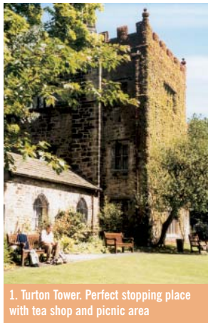
1. Turton Tower. Perfect stopping place with tea shop and picnic area

At the far end of the car park, with your back towards the reservoir, observe two small gullies. Take the path towards the right-hand gully and climb the path to the stile seen on the right (just before a tiny reservoir). Follow the path up the hillside. Cross the road, go through the gate and continue up the path. Turn right at Greens Arms Road then left along a track at the bend in the road. You pass Clough House Farm on your left and eventually go through a kissing gate next to a large gate.