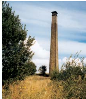
3. Old Russia Lodge Chimney – a remnant of the Industrial Revolution

Turn right down Birches Road and go straight ahead with Printers Court cottages on your right. Turn left at the end of the cottages. Houses now replace the bleaching and printing works of the Walker family, although the square stone chimney 3 remains above, as does the lodge, given the local name of Old Russia Lodge. Turn right through the new houses and take the steps that go straight up the hill to the left out of Quarlton Vale. Join a track at the top of the steps and pass the chimney on the right. Go through a kissing gate into an open field and continue along the path up the field. Below on the left, are lodges including Old Russia.