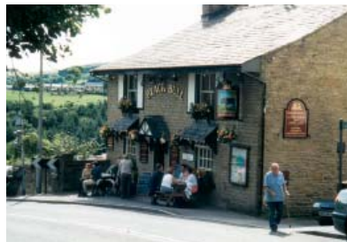
4. The Black Bull at Edgworth on the West Pennine Moors

Various sections of the reservoir have been designated national Conservation areas and are set aside as wildfowl