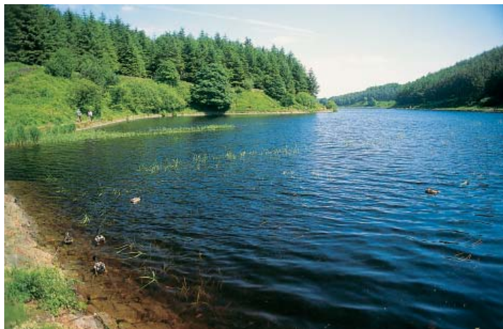
6. Entwistle Reservoir: A centre for nature, history and leisure

Strawbury Duck , Entwistle (01204) 852013