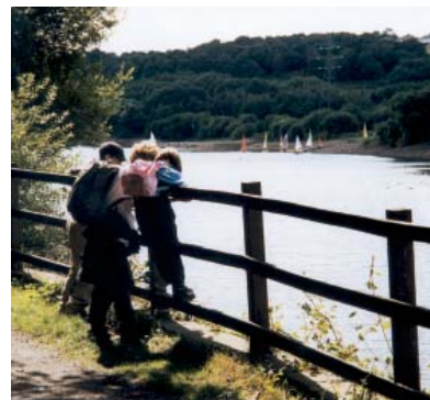
2. Jumbles Reservoir and Sailing Club

Continue along the track as it curves down to the left with a stream on your right to cross over the Blackburn to Bolton Railway line. Note the decorated railway bridge built when the line was constructed in 1848. It is a legacy of James Kay, a textile entrepreneur and once owner who insisted on their style, to be in keeping with the rest of the estate. You then pass an old waterwheel on your left, just before Turton Tower 1 . The wheel, originally from Black Rock Corn Mill near the Turton Bottoms road bridge was restored and