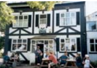
5. The Strawberry Duck – good menu, good beer (also accommodation)

Climb the stile into an open field to reach Edge Lane. Turn right along this road and cross the railway. You may like to enjoy a drink at the walker's popular haunt, the Strawberry Duck 5 .