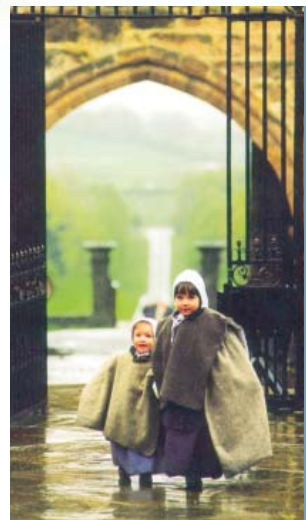
3. Houghton Tower, magnificent historic hall with Shakespeare connections

mansion. It was here that James I is said to have knighted the loin of beef – sirloin. It is open to the public but it is best to check the opening times (01254) 852986. Continue along the river to the bridge. Upstream notice Houghton Bottoms, a good example of a water-powered mill site, with a weir, race and mill stile all clearly visible.