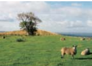
2. Spring Gorse on Yellow Hills

your right is the Clog and Billycock public house. Its name came from the unusual dress of its one-time landlord, as billycock is the old name for a bowler hat. Opposite the pub is one of two fine 18th century rows of handloom weavers' cottages. In the distance you may be able to see the ruins of Woodfold Hall, which was besieged in 1818 by 6,000 handloom weavers demanding an advance of wages.