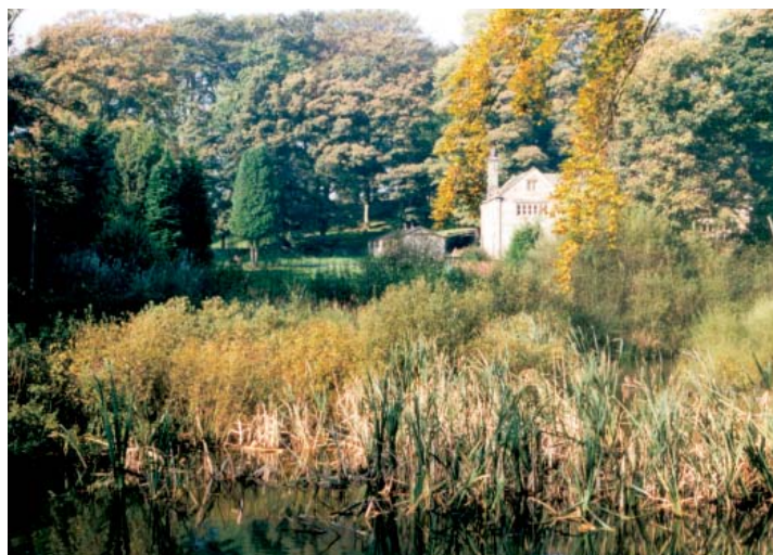
Pleasington Old Hall & picturesque setting