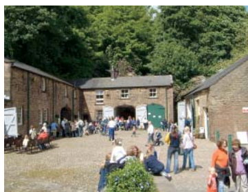
5. Return to the starting point

Continue down the sandy path to emerge at Pleasington playing fields. Turn right along the road to Butler's bridge. Once over the bridge turn immediately left along the river footpath to return to the starting point 5 .