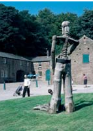
1. Witton Country Park & Visitor Centre

The Witton Weavers Way begins in the picturesque Witton Country Park, a legacy from the Feilden family, wealthy landowners. The 480 acres of mixed woodland, parkland and farmland surrounded the now demolished Witton House (built in 1800). The estate was bought by Blackburn Corporation in 1946 and opened up to the public.