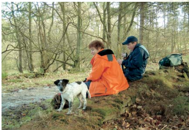
Time for a rest