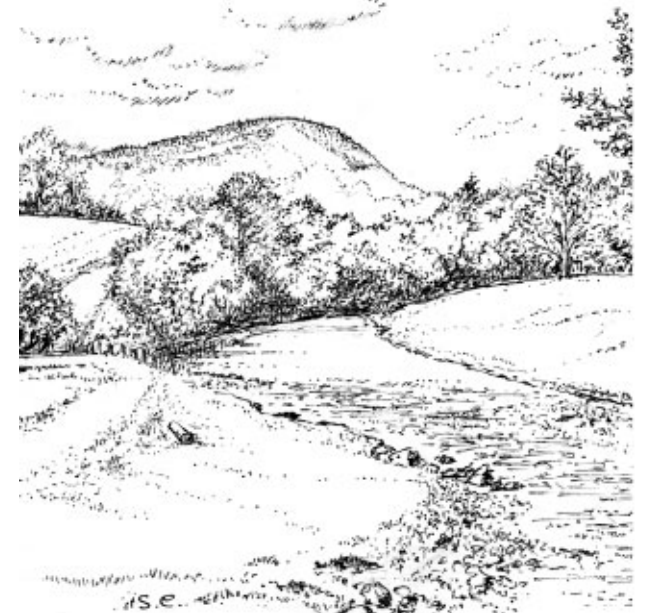
Kemple End & the River Ribble.