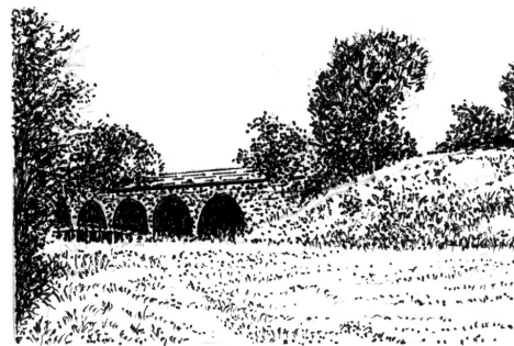
The railway Viaduct from the S.West